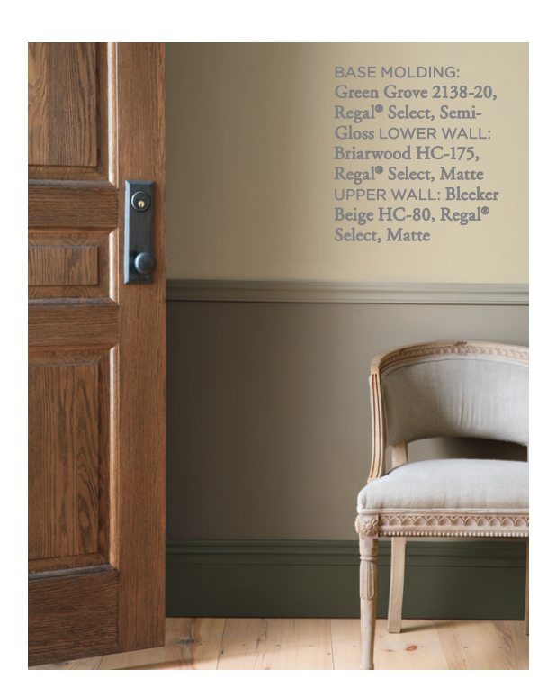
Create architectural interest by painting the walls with different shades of one color. Keep the darker hue closer to the bottom for an ombre effect.